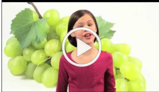
Baby Language Song ASL

Check out these Additional Summer Resources available through our SESA Lending Library!